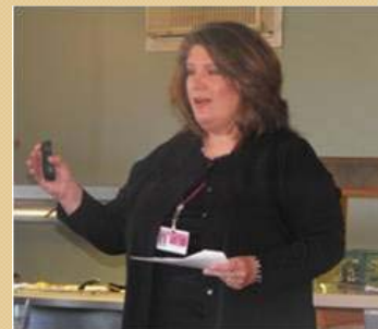
Article & photo courtesy of the Herald News

She stated, " it takes a village to raise a child—we build memories and futures".