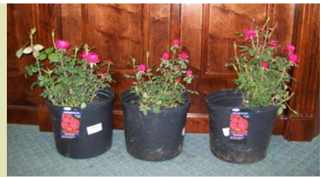
Earth Day 2009 Wal-Mart donated roses for down town beautification!