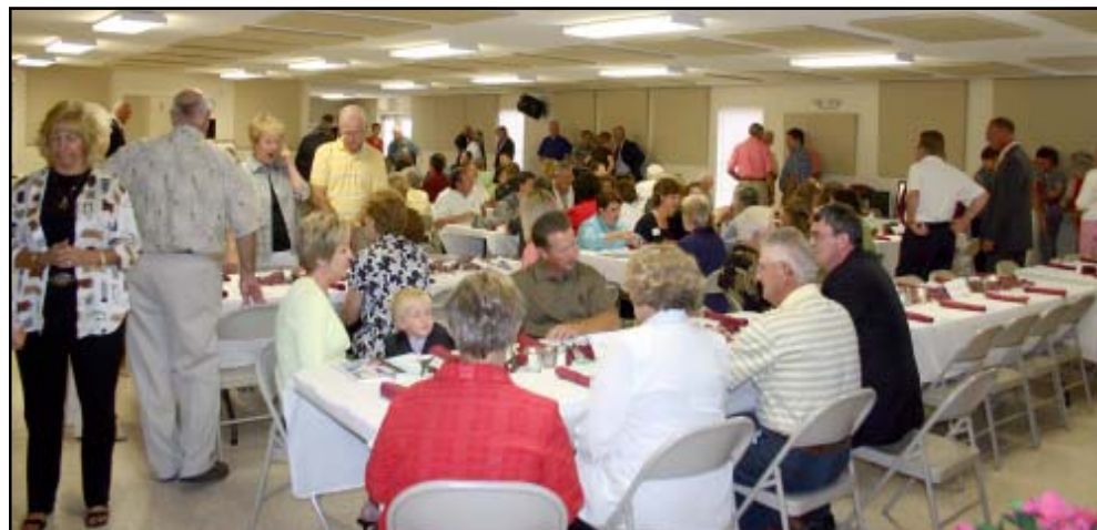
Approximately 125 people gathered for the Chamber dinner held in the Community Building of the Extension Office in Hardinsburg.

July 2006-June 2007-WXBC-Public Relations, Breckinridge Herald News -Public Relations.